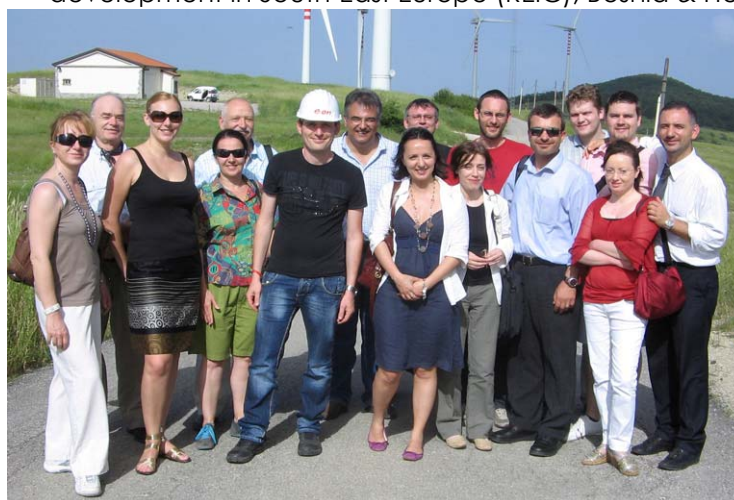
ENER-SUPPLY partners in Potenza, Italy