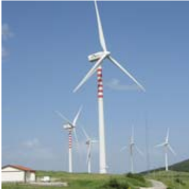
Wind farm (Potenza District), Italy